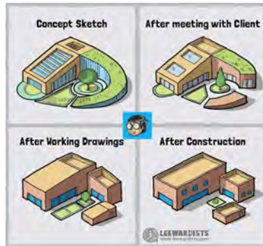
" Take me somewhere expensive... "